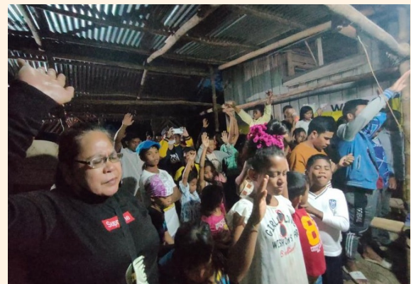
Tinonanon tribe members worshipping Jesus!