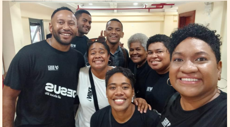
Some team members from Sounds of the Nations Fiji..