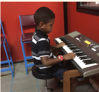
One of the students practicing what he has learned.