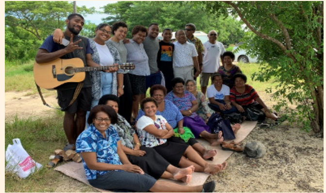
Some of the Mission Fiji students and teachers