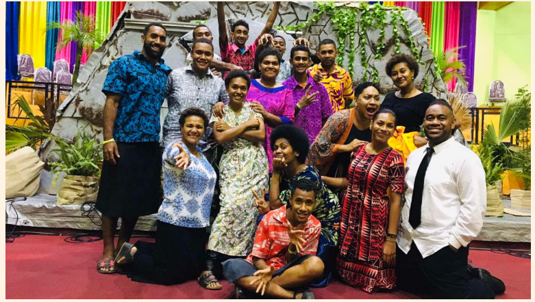
Sounds of the Nations Fiji Team