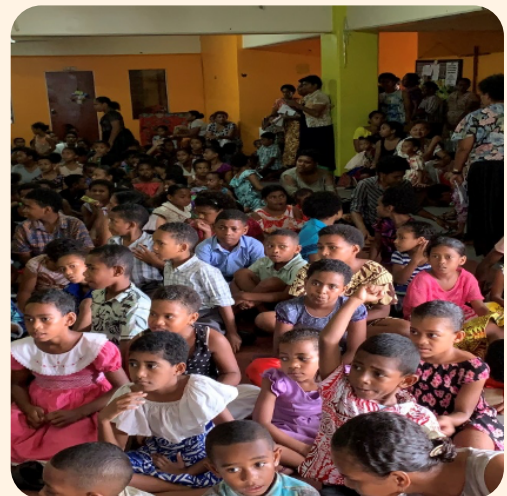
Some of the children from local church

More than eight hundred children were involved in powerful declaration and singing as we worshiped King Jesus. There is a shift of programs and activities as we allow the Holy Spirit to do new things in the children's church and testimonies of God's healing as the children pray for the sick. We praise God for giving us the opportunity to be used in our local church.