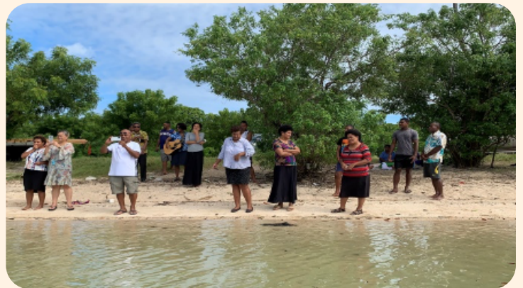
Some of the Mission Fiji students that were baptized