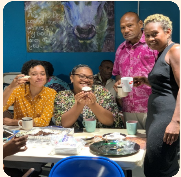
Some of the students from the Prophetic School